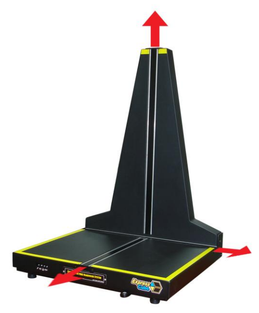
Sensor Lens Removal Points

If a sensor lens becomes foggy (opaque) from wear, cracked or broken it should be replaced. All three lenses have a cover to permit safe and quick replacement of the lens. The covers are held on by two screws and there locations are illustrated below.