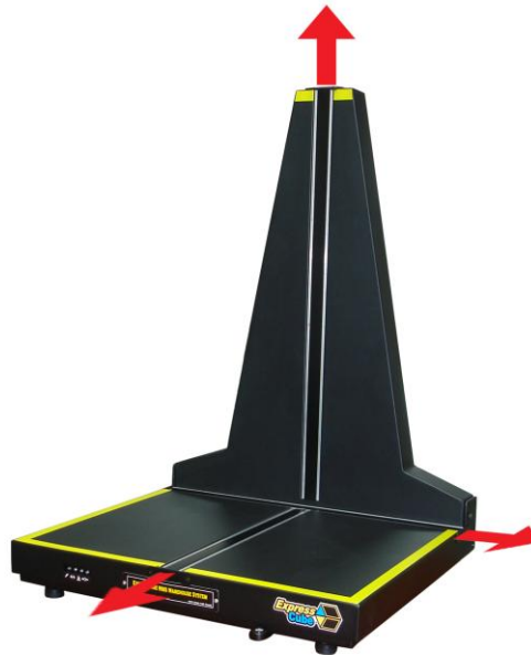
Sensor Lens Removal Points

If a sensor lens becomes foggy (opaque) from wear, cracked or broken it should be replaced. All three lenses have a cover to permit safe and quick replacement of the lens. The covers are held on by two screws and there locations are illustrated below.